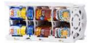
Cupboard Holds 20 cans

These assemble easily and are expandable; having a good rotation of our canned items means not having to throw any away or hurry up and use them.