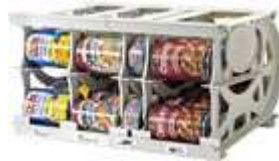
Pantry Holds 40 cans