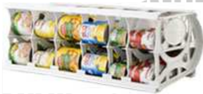
Pantry Plus Holds 60 cans